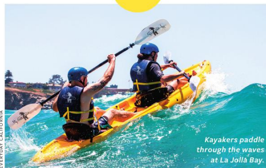
Kayakers paddle through the waves at La Jolla Bay.

Whale-watching season runs roughly from December to April, with boat excursions departing from various locations in San Diego Harbor and Mission Bay. Point Loma's Cabrillo National Monument—where in 1542 Juan Rodriguez Cabrillo became the first-known European to set